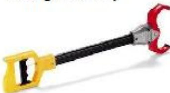
Claw grabber toy