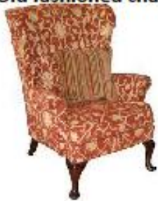
Old fashioned chair