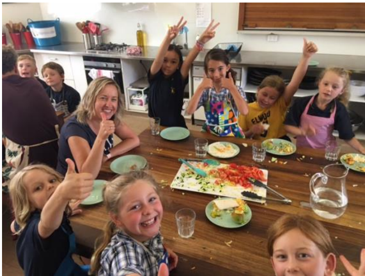
Kitchen Garden Class