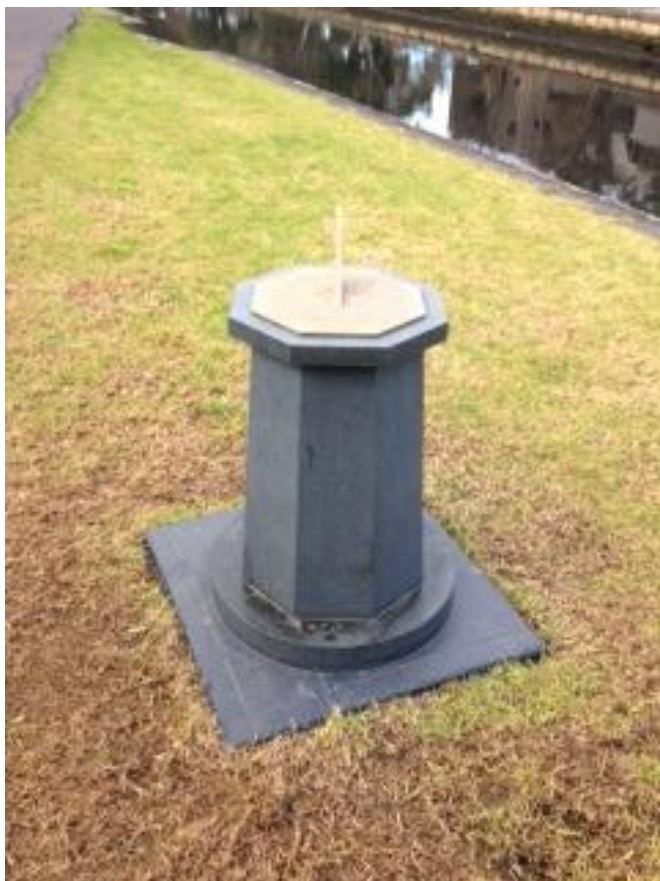
Photo : Another view of the sundial.