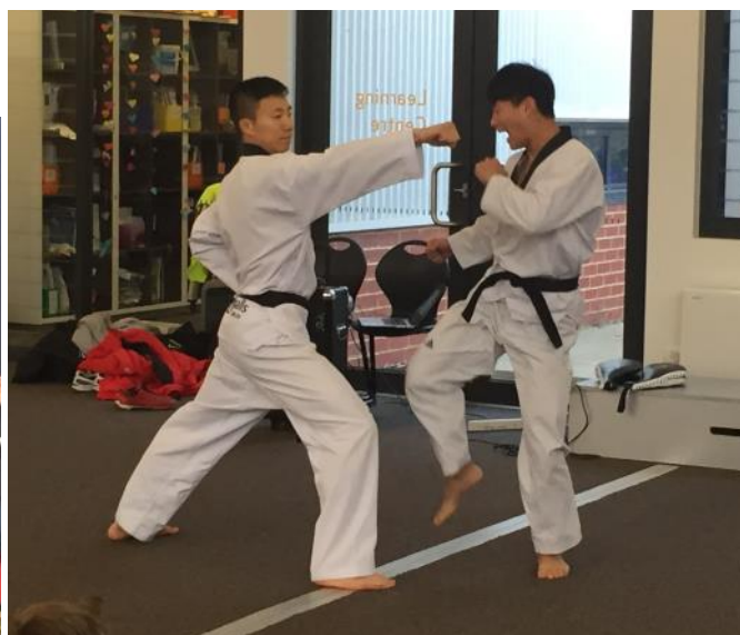
Photos : Asia Week Incursion Performances Grade 5 Taekwondo & Preps Spirit of Indonesia

Winter Onsieland – Aug Market Centenary Paver Order Form